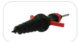
auger base (ZOOM-AUG)