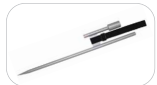
ground stake (included)