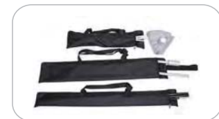
Zoom hardware & bag set