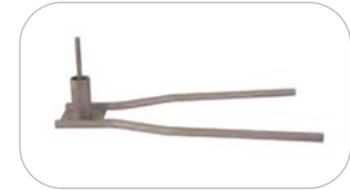
drive-over base (ZOOM-VEHICLE)