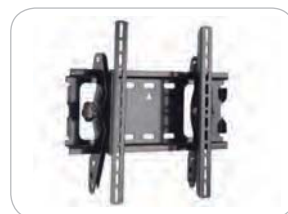
Monitor Bracket 2 LN-LCD2-B 26" - 42" LCD max weight = 100 lbs