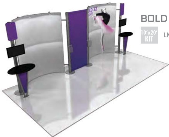
BOLD 32 10'x20' KIT LN-K-32