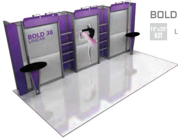
BOLD 38 10'x20' KIT LN-K-38