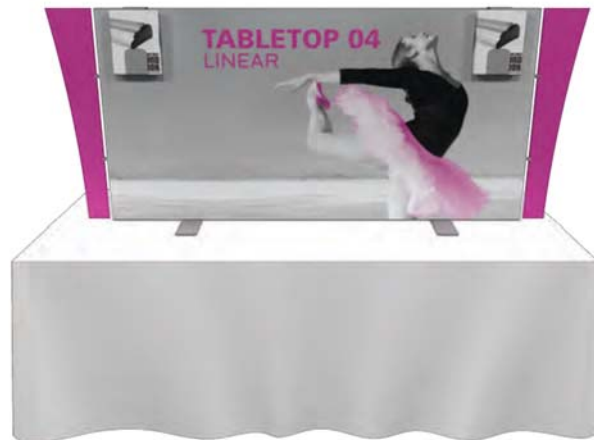
8' tabletop footprint dimensions: 96" w x 39.37" h x 17.72" d LN-K-TT-04