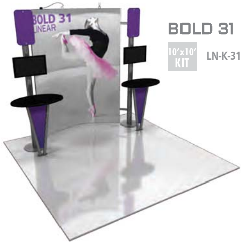
BOLD 31 10'x10' KIT LN-K-31