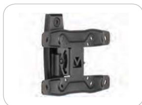
Monitor Bracket 1 LN-LCD1-B 13" - 27" LCD max weight = 50 lbs