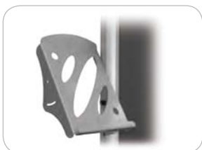
Literature Pocket LN-112