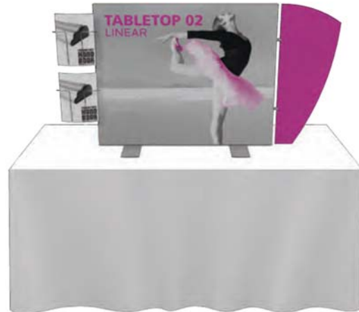
5' tabletop footprint dimensions: 61.5" w x 31.5" h x 17.72" d LN-K-TT-02