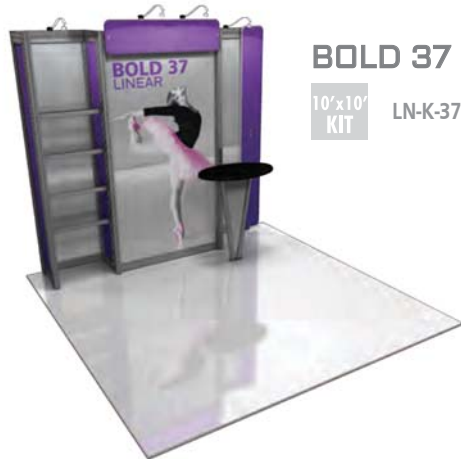
BOLD 37 10'x10' KIT LN-K-37