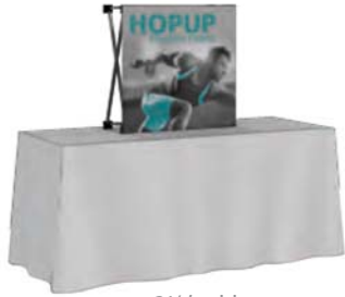
2½' tabletop footprint dimensions: 31" w x 31" h x 12" d HOP-1X1-S