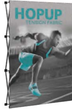
5' full height standard display footprint dimensions: 60.06" w x 89.13" h x 12" d HOP-2X3-S