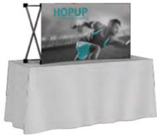
5' tabletop footprint dimensions: 63.5" w x 31" h x 18.5" d HOP-2X1-C