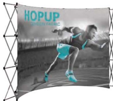
11 1/2' full height standard display footprint dimensions: 139" w x 89.13" h x 47" d HOP-5X3-C