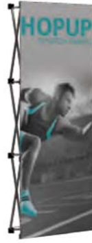
2½' full height standard display footprint dimensions: 31" w x 89.13" h x 12" d HOP-1X3-S