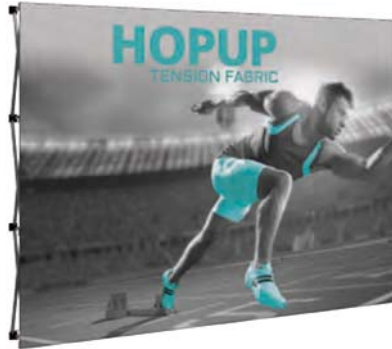
10' full height standard display footprint dimensions: 118.19" w x 89.13" h x 12" d HOP-4X3-S