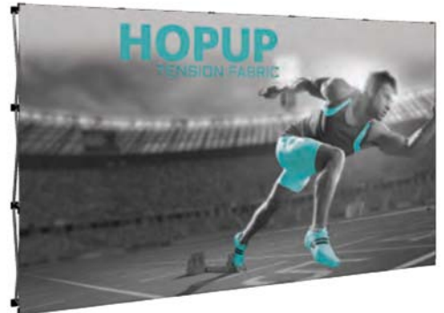
11½' full height standard display footprint dimensions: 139" w x 89.13" h x 12" d HOP-5X3-S