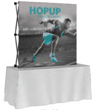
5' tabletop footprint dimensions: 60.06" w x 60.06" h x 12" d HOP-2X2-S