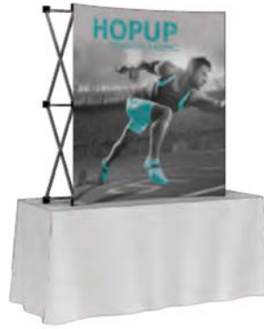
5' tabletop footprint dimensions: 63.5" w x 60.06" h x 18.5" d HOP-2X2-C