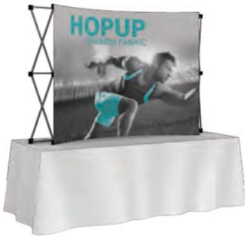
7 1/2' tabletop footprint dimensions: 91" w x 60.13" h x 23.25" d HOP-3X2-C