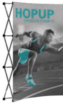
5' full height standard display footprint dimensions: 63.5" w x 89.13" h x 18.5" d HOP-2X3-C