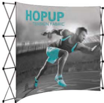
10' full height standard display footprint dimensions: 115" w x 89.13" h x 33.5" d HOP-4X3-C