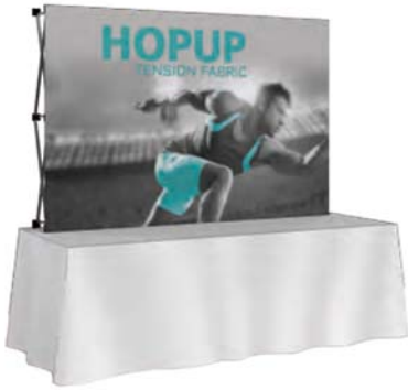
7½' tabletop footprint dimensions: 89.13" w x 60.06" h x 12" d HOP-3X2-S