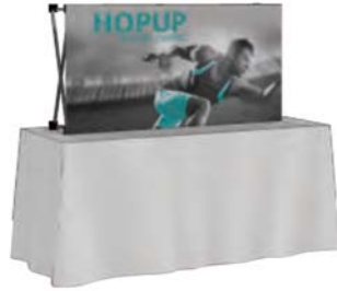
5' tabletop footprint dimensions: 60.06" w x 31" h x 12" d HOP-2X1-S